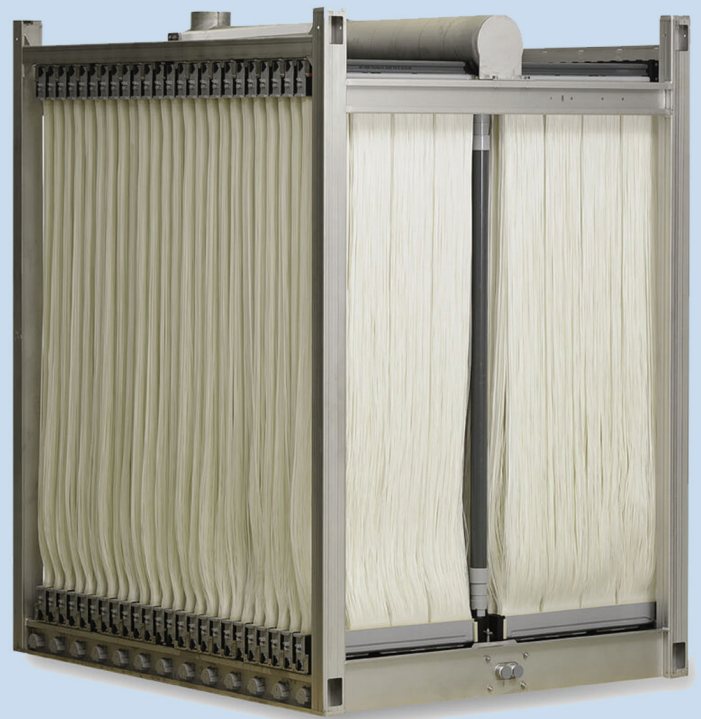
GE / Suez

Sewage Treatment Plants that Meet KSPCB Norms